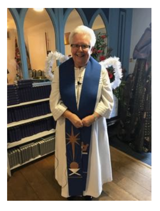
Created a wee bit earlier